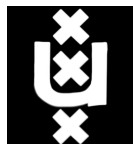
Figure 1: The UvA logo